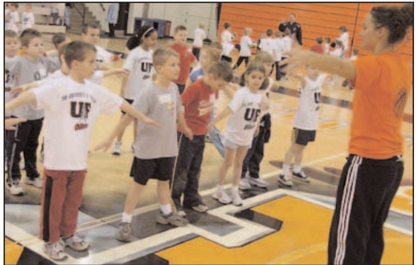
UF students led Findlay-area children in a fitness day at Croy Gymnasium on March 28.