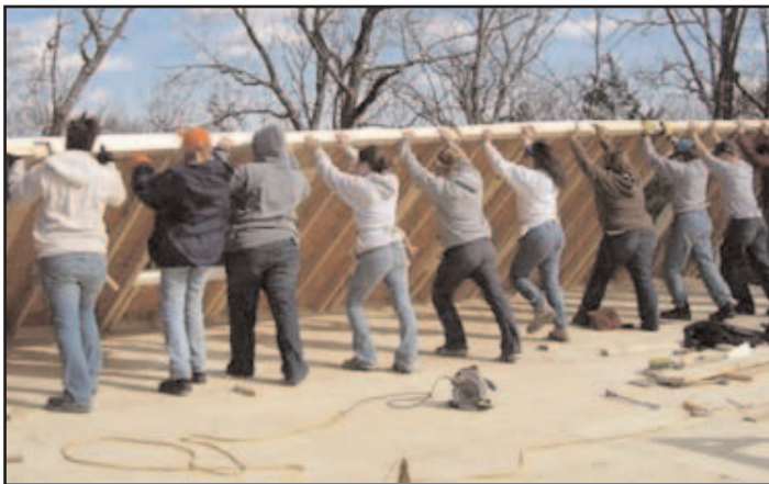
Students, faculty and staff participated in Habitat for Humanity's spring break program, building a house for a seven-member family in Branson, Mo.