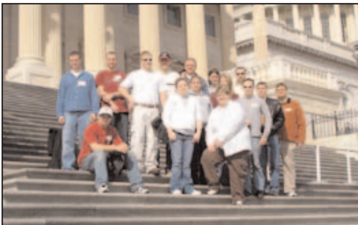
Fifteen Criminal Justice Club members visited Washington, D.C., over spring break, touring the Metro Police Department, the White House and the Holocaust Museum.