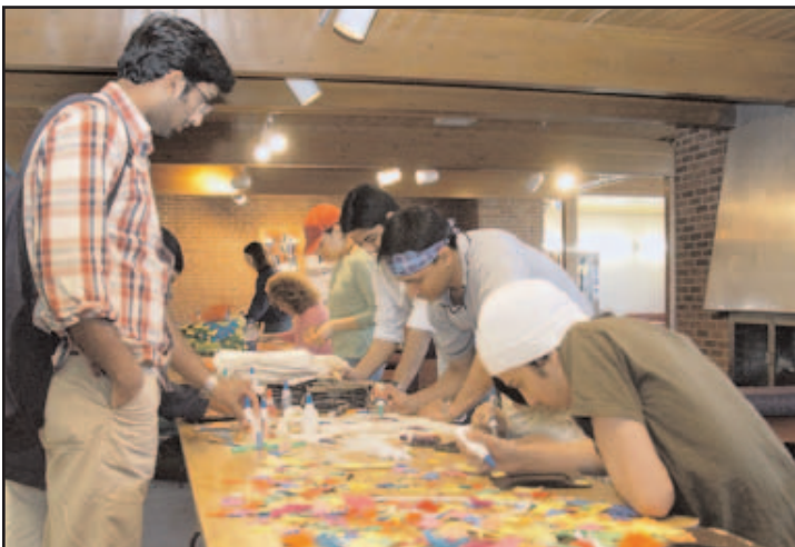
The University community celebrated spring with Spring into Action Art Day March 24 in the AMU.