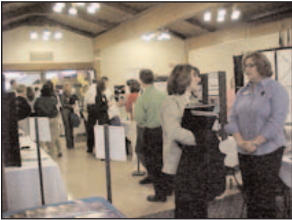
Future nuclear medicine technologists, physical therapists, athletic trainers and occupational therapists met with potential employers during the College of Health Professions' April 1 job fair.