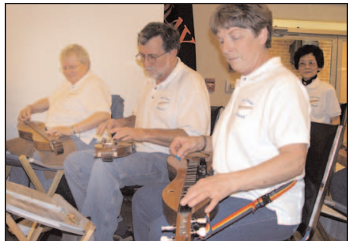
Senior Forum participants were treated to traditional American songs as performed by the Dulcimer Gatherin' musical group.