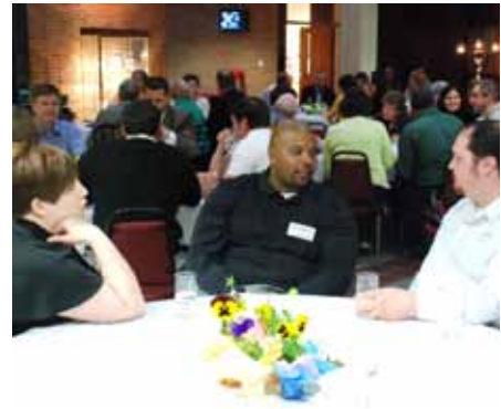
Nearly 80 alumni, faculty, staff, trustees and friends enjoyed an evening of jazz and a dessert buffet courtesy of the Office of Alumni & Parent Relations.

enjoyed golfing, eating, exploring, shopping, acting, a mystery dinner, talking and laughing!