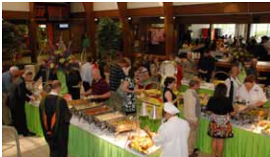
More than 930 people enjoyed the commencement brunch hosted by the Alumni Association.

The Alumni Association Board of Governors hosted the traditional commencement brunch on Saturday, May 1. Board members were busy escorting more than 930 graduates and their families to their seats. The Alumni Memorial Union was filled to capacity and was decorated festively by Sodexo for the occasion.