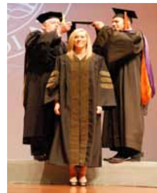
The first class of pharmacy students had a doctoral hooding ceremony prior to the commencement service.

The University will host a family-friendly arts festival from noon – 4 p.m. Sunday, June 6, on campus. Art demonstrations and workshops, led by students and faculty members, will be offered, as well as art zones for children. Roving artists will include a balloon artist, body paint artist, caricature artist and spray can artist, in addition to jugglers, comedians, a sword swallower and more. Live entertainment will include poetry reading, storytelling and a comedy act. Art exhibits in the Mazza Museum, Lea Gallery and Old Main will be open; the Oiler Mart inside the Alumni Memorial Union will be open; and food vendors will be on site. Derrick the Oiler will be posing