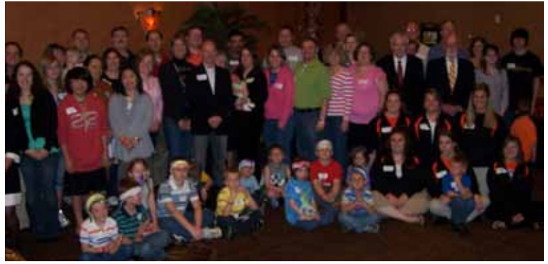
Alumni and their families at the Kalahari dinner reception April 17.