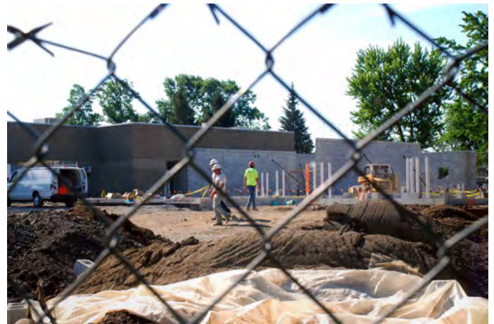
Progress is visible on the Davis Street Building addition, which has a finished foundation, and walls are being built.