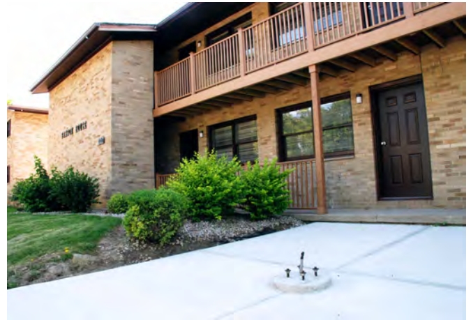
Oiler Pointe, UF's newest housing option, is shown here with new walkways, doors and sidewalk.

Construction is well under way on a new science building, which is being constructed as an addition to the existing Davis Street Building. The new building will add eight cutting-edge science laboratories, high-technology classrooms and lecture halls, eight faculty offices and student lounges.