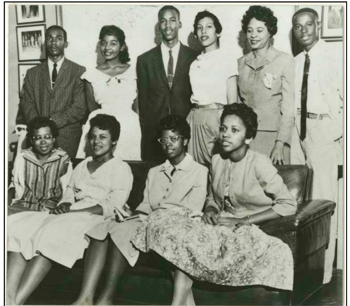
The Little Rock Nine