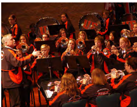
The Oiler Brass marching band in concert.