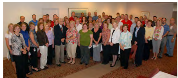
Employees of Marathon Petroleum Co. in Findlay who are graduates or current students of The University of Findlay gathered for a luncheon on Sept. 2.