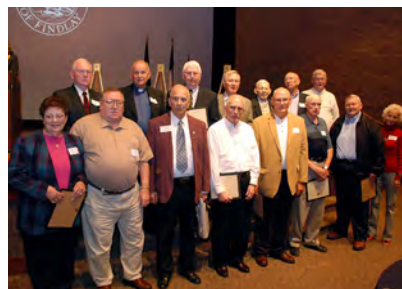
The Class of 1960 celebrated its 50th anniversary by helping fund a campus study area and establishing a scholarship.

The annual Alumni Association Breakfast was held at Winebrenner Theological Seminary with 175 in attendance for the recognition of the alumni awards recipients, the Class of 1960 50th anniversary, the annual meeting and the traditional rose ceremony honoring alumni. Also taking place on campus were a Nuclear Medicine Institute open house; an African-American reunion, with a tour of the Buford Intercultural Services Center; and an alumni swimming and diving meet.