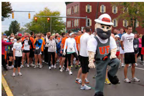
More than 275 people participated in the 5k run/walk and Little Oiler Fun Run, raising $2,225 for Campus Ministry.

StudentTs for Alumni Relations (STAR) club students helped prepare for Homecoming weekend, Oct. 1-2, by painting Main Street in front of campus. They also tied orange and black ribbons on trees and poles from campus through downtown to Donnell Stadium. As a final touch, they painted the windows at Wilsons – a place that many alums return to for a burger. Thanks to these dedicated and hard-working students for pumping up the Oiler spirit!