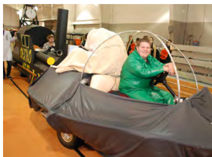
The Alpha Sigma fraternity took third-place with its spaceship with ET golf cart. Behind is the winning locomotive golf cart sponsored by OESHO environmental club.

Unexpected rain drove the front lawn celebration into the Koehler Fitness and Recreation Complex. The golf cart parade was held on the track in the Malcolm Athletic