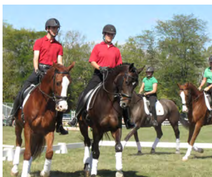
The UF dressage team performed a quadrille for the equestrian festival. The team placed fourth at the 2010 Intercollegiate Dressage Association national championship and was first in the region.

Family Weekend, held Sept. 24-25, began Friday morning with 244 parents attending classes with their students. The Office of Alumni & Parents Relation hosted a welcome reception at the new Stout Alumni Center in the afternoon, dishing out Dietsch's ice cream as a treat. At the Animal Sciences Center in the evening, families enjoyed a hayride and seeing the Budweiser Clydesdale horses that were stabled there while in the area for community activities. Saturday began with