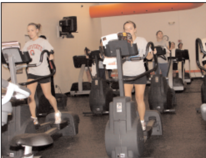
Student, faculty and staff are taking full advantage of the University's Cardio Center, as the winter weather keeps many indoors.