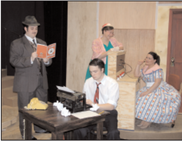
"Bells Are Ringing" runs Feb. 22-26.

operator answered the telephone if someone else couldn't. The production tells the tale of how the lines are blurred between doing a job and eavesdropping.