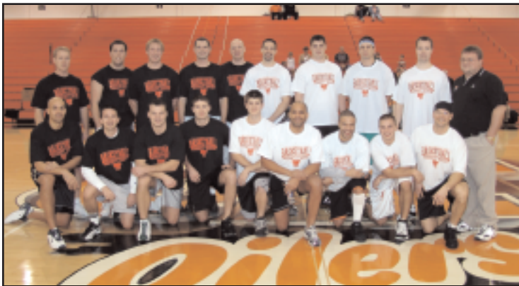
Nearly 30 alumni of the men's basketball program returned to campus Jan. 28 to play in the Men's Alumni Basketball Game.