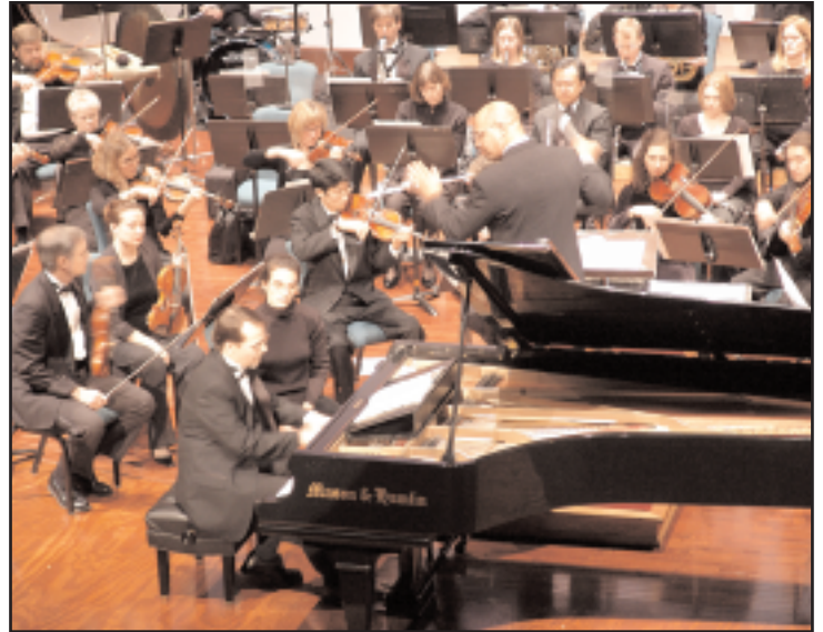
A sold-out crowd enjoyed the Toledo Symphony's performance of "Symphony No. 2 in C Minor, Op. 17," "Rhapsody in Blue" and "Kaintuck" on Friday, Jan. 27.