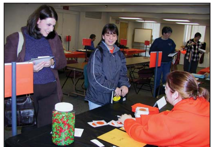
These students are finishing up some last-minute chores at the Senior Salute Nov. 20.