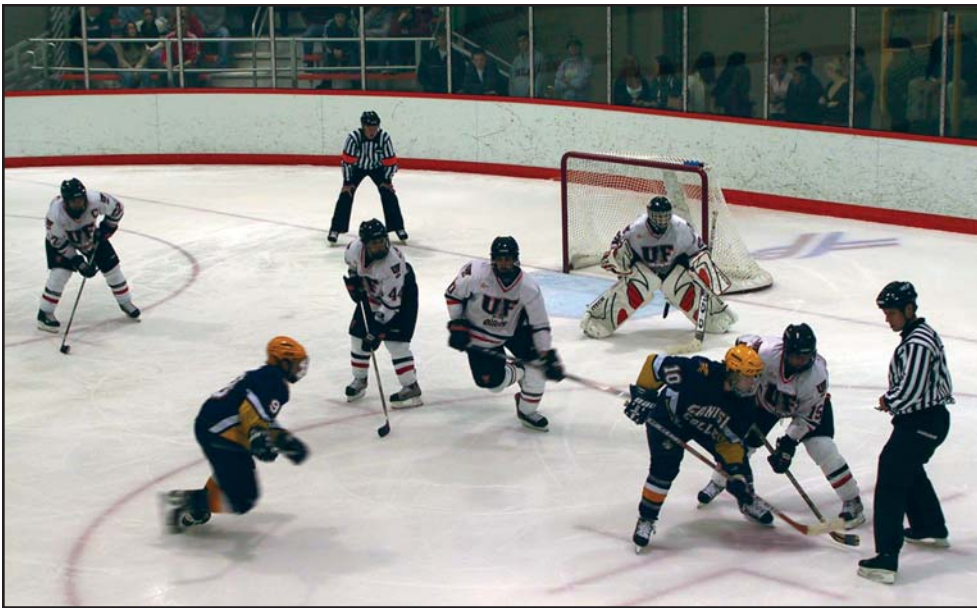
The men's hockey team won 5-0 and tied 2-2 in overtime against Canisius College Nov. 21 and 22. The team takes on Air Force Academy Dec. 5 and 6 at 7 p.m. here at home.