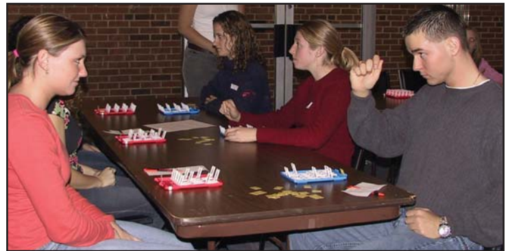
These students use their sign language skills during the American Sign Language social Nov. 14.