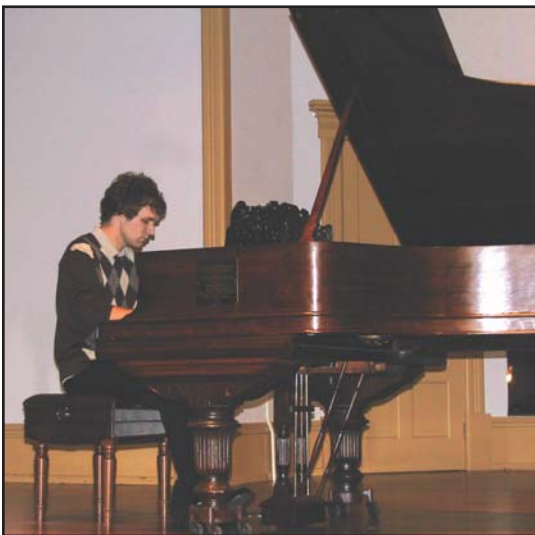
This student participates in the piano recital Nov. 20 in Ritz Auditorium.