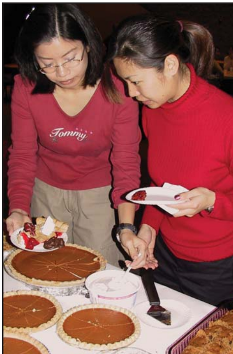
A traditional Thanksgiving meal was served Nov. 26 to international and American students who did not have a place to go for the holiday.