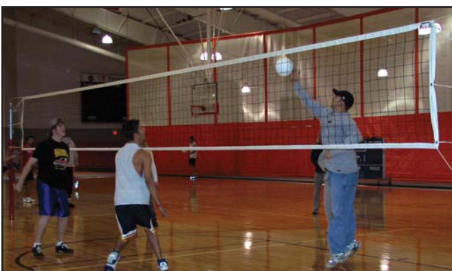
Intramural volleyball is a popular activity for many UF students.