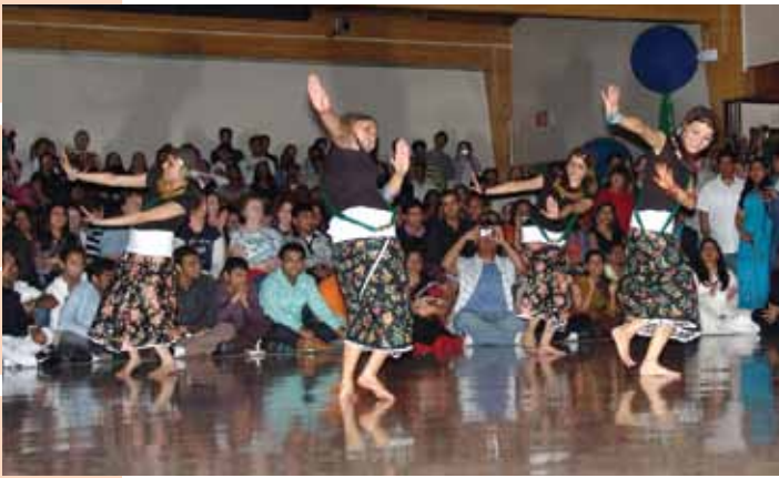
International students shared their native food, costumes and dances with the campus and community April 11 during the 40th International Night. Students also provided entertainment throughout the evening, including dancing, singing, fashion shows, a karate demonstration and more.