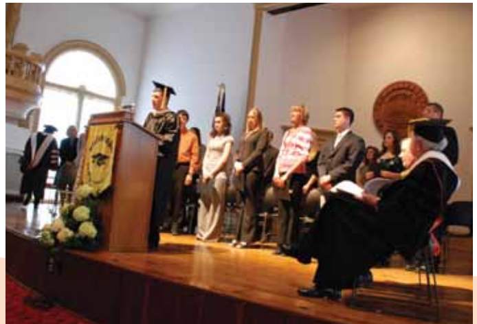
UF held its first Mortar Board installation and initiation ceremony March 25, welcoming the charter class of 25 students into the national honor society that recognizes college seniors for their scholarship, leadership and service. Above, students participated in a response to become members of the Mortar Board society.