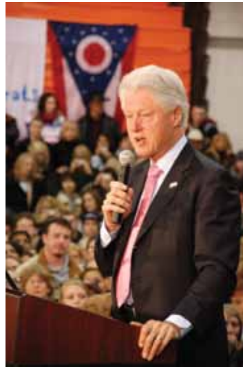
Former President Bill Clinton made a campaign stop at The University of Findlay on Feb. 29. An estimated crowd of 1,200-1,400 people packed into Croy gymnasium to hear him speak on behalf of his wife, New York Sen. Hillary Rodham Clinton.