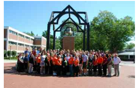
Sixty-five out of the 133 alumni who are employed by The University of Findlay attended a luncheon to honor them.

Office of Alumni & Parent Relations. Attending were 65 of the 133 UF alumni who work full-time for the University. The average length of employment is nine years!