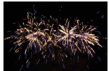
Fireworks lit up the sky behind the Koehler Complex, adding extra sparkle to Homecoming activities on Friday evening.

• New and exciting activities for Friday evening of Homecoming included an entertaining competition on the court with the Harlem Wizards vs. the Orange and Black Attack of alumni, faculty and staff members. The evening was highlighted with the first campus fireworks display, which was truly awesome.