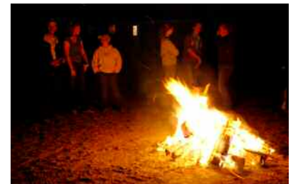
Friday evening at the western farm included traditional hayrides and a blazing bonfire.

involving students, faculty and staff. The English equestrian staff invited all parents and students to enjoy a mini grand prix and equestrian festival on Saturday. More than 600 parents, students and siblings enjoyed a picnic while watching combined dress-