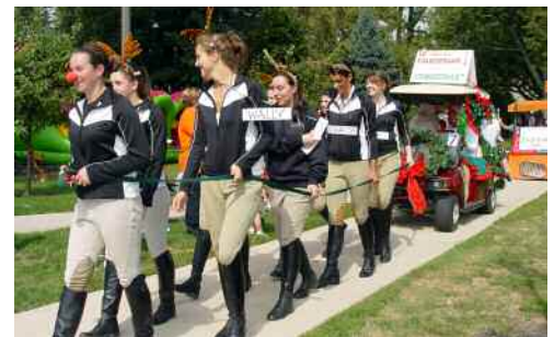
“Every Day is Like Christmas” was the theme of the second-place golf cart sponsored by the English equestrian team.