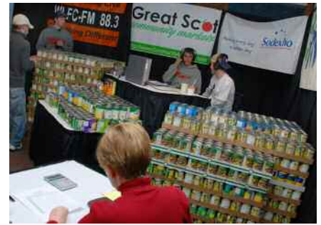
The campus and Sodexo dining service will again try to break the Guinness World Record on Nov. 12 for the largest food drive.