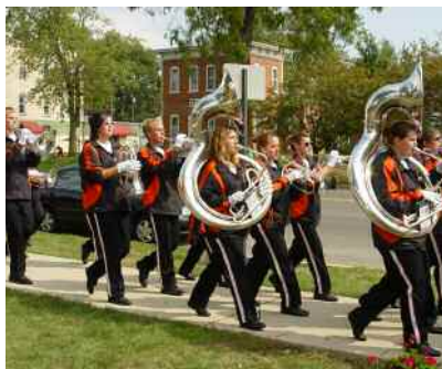
The Oiler Brass marches down Main Street as a part of the Homecoming golf cart parade.