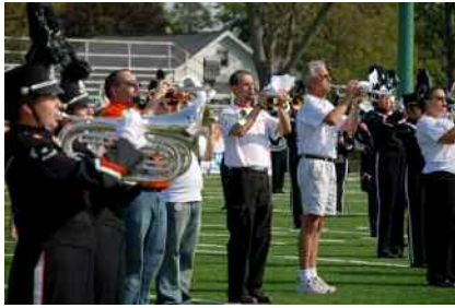
Returning alumni joined the Oiler Brass for a performance at Homecoming.

• The sixth annual marching band and Oiler Brass reunion was held, with alumni joining the Oiler Brass marching band in the golf cart parade on campus and the pre-game and half-time shows at Donnell stadium.