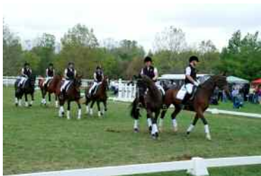
The Fall Family Festival held Saturday at the James Child Jr. Equestrian Complex featured a demonstration by the dressage team, which features precision movements and patterns.

sage and reining horse performances, and the final round of the mini jumping grand prix. Children enjoyed the clown, face painting and pony rides. Some families took advantage of the Mercy Me concert Saturday evening in the Koehler Fitness and Recreation Complex.