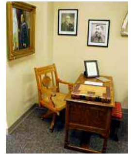
This desk and chair are the 1886 originals from the president’s office.