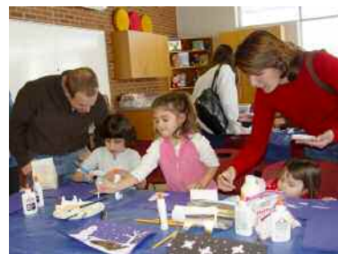
Families enjoy crafts and storytelling at Mazza Funday Sundays the first Sunday of each month.