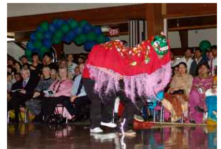
Chinese students performed a traditional Chinese New Year line dance at the 40th International Night.

April 11. The day began with a ribbon-cutting ceremony in the Alumni Memorial Union with the Chamber of Commerce Red Coat ambassadors. The event's theme was "Bringing the World Together." Each country was represented with a booth where visitors could visit with students to learn about their countries and customs through food, traditional dress and other items on display. Students also provided entertainment throughout the evening, which included dancing, singing, fashion shows and a karate demonstration.