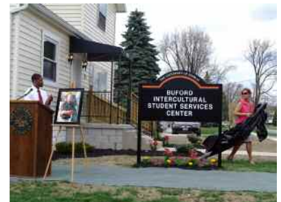
Barbara (Balcik '90) Buford unveiled the sign for the Buford Intercultural Student Services Center at the April 22 dedication.