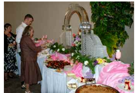
Families enjoyed a brunch prior to commencement sponsored by the Alumni Office and Alumni Board of Governors.

On Saturday, May 3, 2008, more than 780 students graduated and celebrated their pursuit of academic excellence. The University of Findlay is the place that opened the door to opportunities for these graduates and has prepared them to embark on a new and exciting journey beyond University.