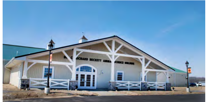
The new Dr. C. Richard Beckett Animal Science Building is a welcome addition to the Animal Sciences Center.

In Croy, the swimming pool was drained, washed and repainted. It also received new grates that are in