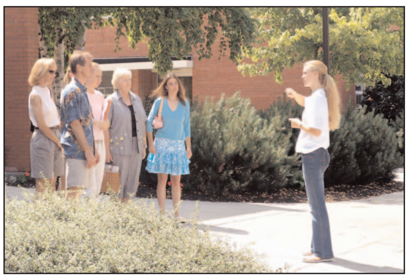
According to the Office of Undergraduate Admissions, more than 160 potential new students and their families have visited campus this summer. The students are from as far away as Texas and Rhode Island.