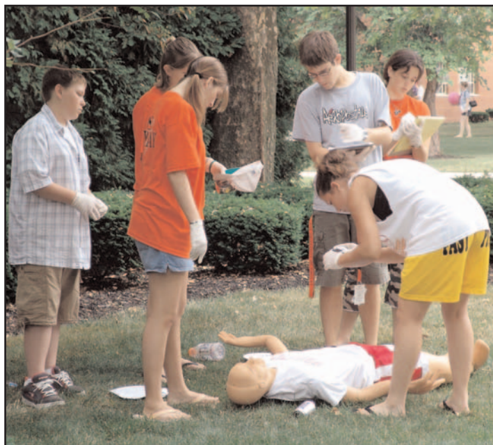
Campers examine a mock crime scene for evidence during the forensic science camp.

The camp is part of the new forensic science program. Approximately 25 students will start in the fall as the University's first class of forensic science majors.