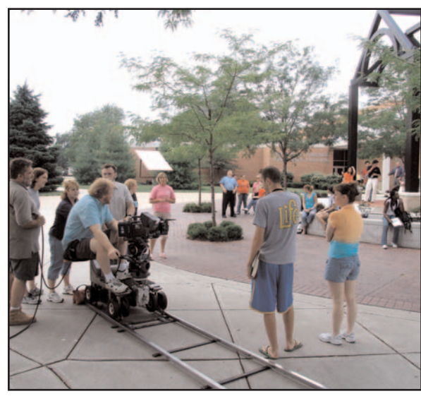
RGB Productions Inc., a video production crew from Maumee, spent three days on campus last week taping the University's new television commercials. The new commercials will begin airing on television and cable networks Aug. 1.