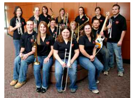
The Jazz Ensemble held its annual Spring Concert on March 29.