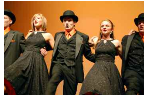
The University Singers will present its annual Family Concert at 3 p.m. Saturday, April 18.