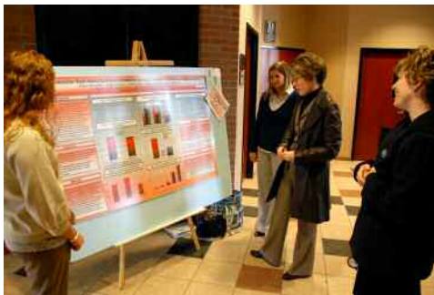
The annual Symposium for Scholarship and Creativity allowed students to present their academic work to faculty and their peers.