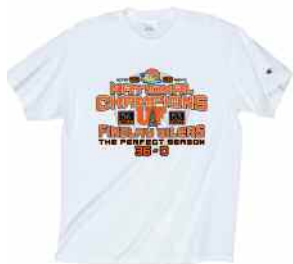
Order your championship T-shirt while supplies last!