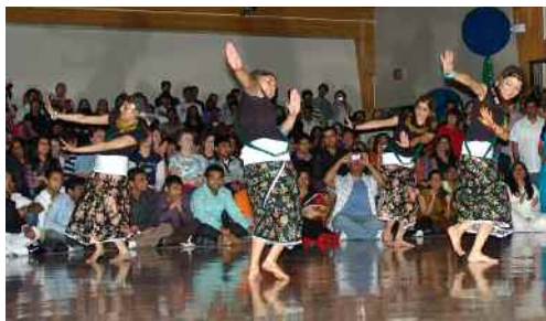
International Night will feature traditional dances, costumes and food, along with displays of artifacts, from more than 15 countries from around the world on April 17.