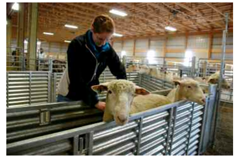
The dedication of the new Dr. C. Richard Beckett Animal Science Building will be Friday, May 1, at 1 p.m.