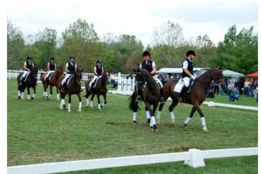
The Intercollegiate Dressage Association national championships will be held April 18 and 19 at the Child Equestrian Complex.