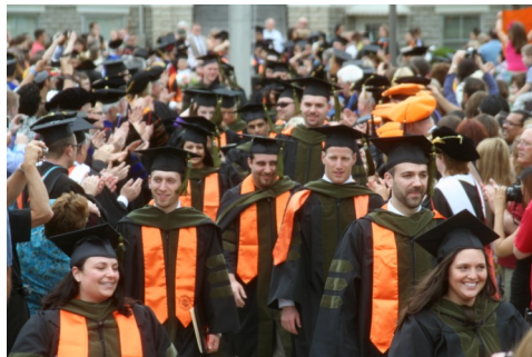
Pictured Above front: The University of Findlay College of Pharmacy 2010 graduation class.