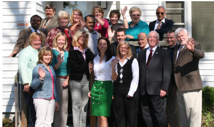
College of Pharmacy Faculty and Staff Fall 2010