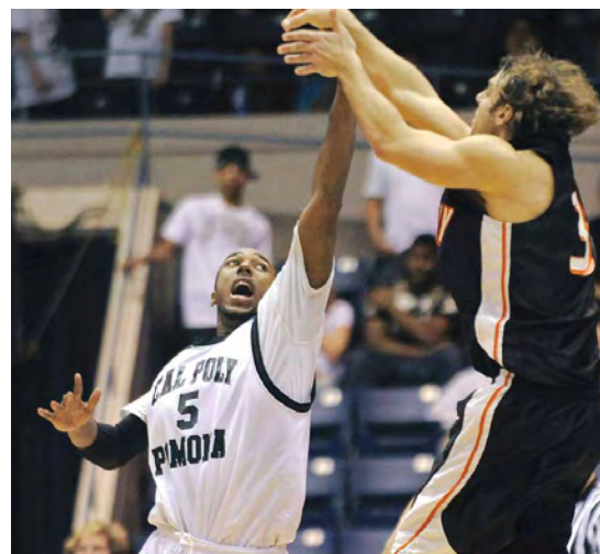
Men's Basketball Championship