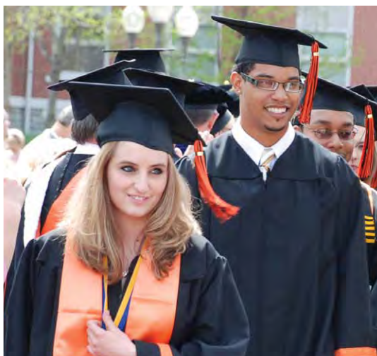
Spring Commencement 2009