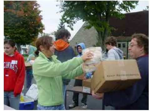
UF students volunteer for Sweet Service Saturdays, which are organized by Campus Compact.