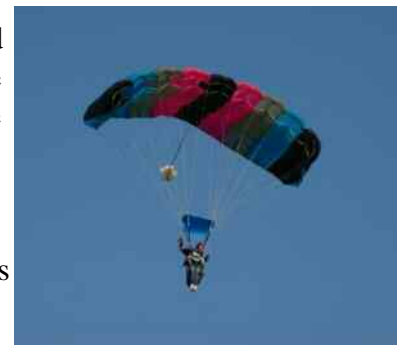
Chavana experiencing the thrill of floating free in a tandem jump.