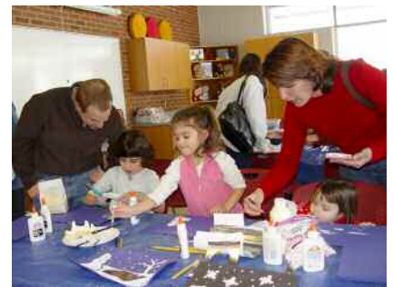
Families get involved in learning activities at Funday Sundays hosted by the Mazza Museum.