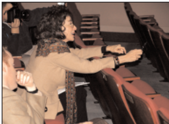
Actress Dixie Carter helped UF theatre and voice students work on their techniques during her visit to campus, Nov. 14-16. "Nothing's easy. You're talented. Now you have to work like dogs," Carter advised.