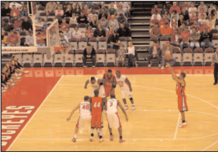
The Office of Alumni and Parent Relations hosted an alumni reception prior to the UF Oilers taking on the Ohio State Buckeyes for an exhibition basketball game on Sunday, Nov. 6. The reception was attended by approximately 250 UF alumni, family and friends.