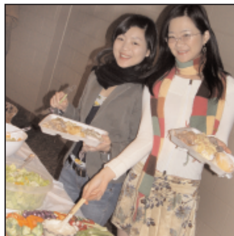
2004 Thanksgiving luncheon.

The University's student population includes 465 international students from more than 30 countries and territories.