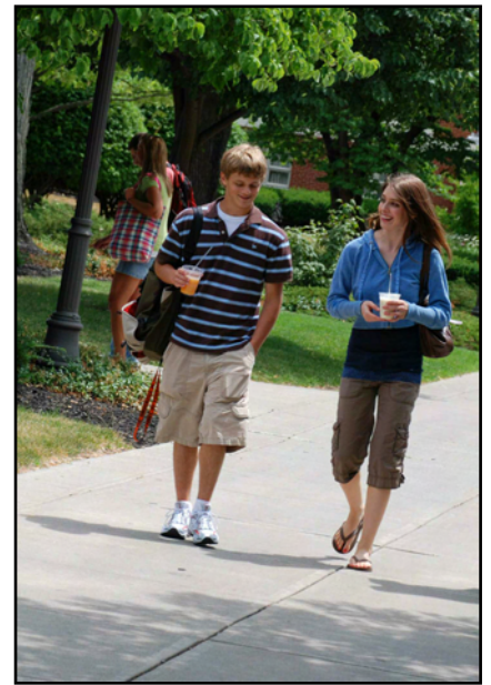
All students will receive the new ID card, which will serve many purposes on campus.

Students may view or update their information by visiting the University home page, www.findlay.edu , KEYWORD: Oiler OneCard. After following directions to reach the Student Academic Information page, they may