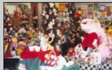
Holiday Gift Shop 2003, overflowing with books and educational toys