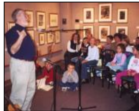
Jack Prelutsky entertaining a rapt crowd

Prelutsky enjoys incorporating puns into his work. Comparing puns with children, he stated, "You