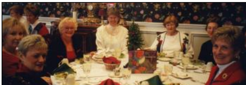
Mazza staff and Enthusiasts at December Board meeting

rotating display of Mazza art and books at the Findlay-Hancock County Public Library. Check it out! (Art is also displayed in the community through the Physicians/ Mazza partnership. See page 5.)