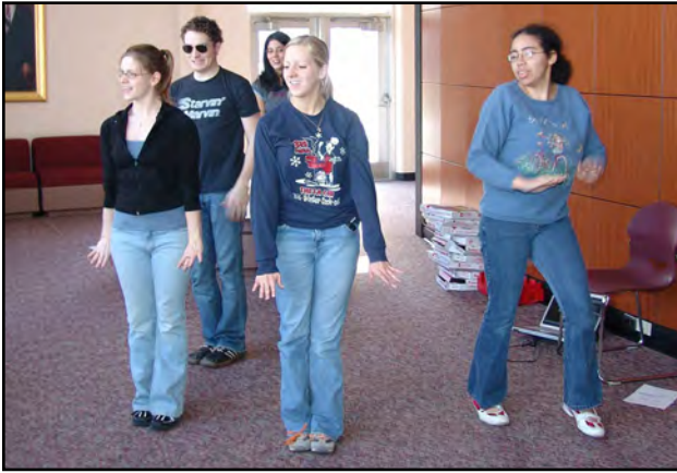
Cast members in “Can’t Bring Sexy Back – J. Timberlake in Da Oprah House” practiced choreography the day of the performance. The group won second place with their original play.

“Top Forty Celebrity Fables” was the theme for Triage Theatre 2007. The production process began with an initial meeting of more than 30 students on the evening of Jan. 19 when Alpha Psi Omega, the honorary theatre fraternity at UF, revealed this year’s theme.