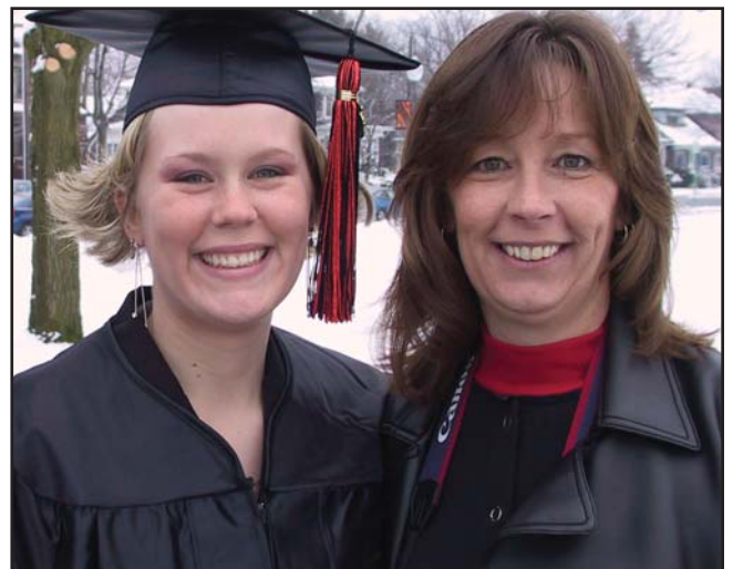
A parent's proudest moment - at the arch ceremony following graduation.