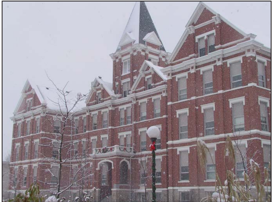
Old Main was dressed for the season when the snow fell.