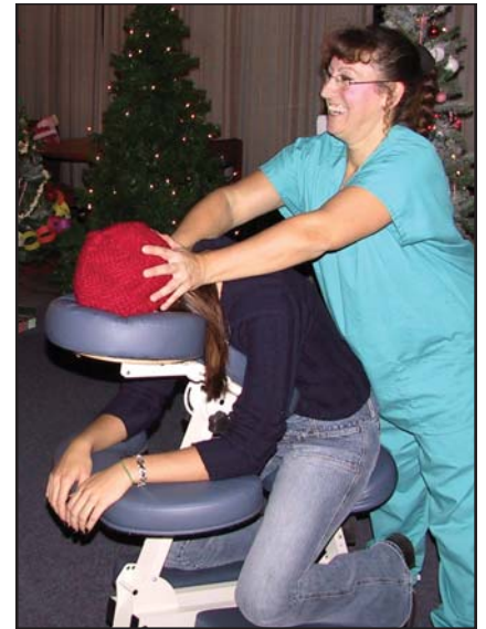
A stress relief program was sponsored by Residence Life on Dec. 3.