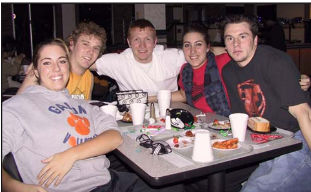
More than 500 students enjoyed Late Night Munchies Dec. 8 as a break from studying.