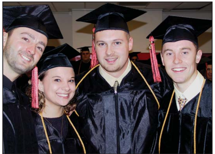
These students were all smiles as they lined up for the graduation procession on Dec. 6.