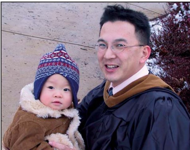
This proud MBA graduate shares the moment with a little one.