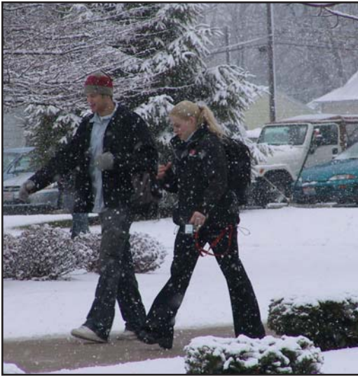
Students, faculty and staff braved the cold temperatures and snowy conditions when Findlay experienced its first snowfall of the season...on the last day of classes for fall 2003.