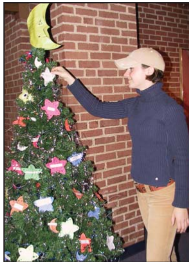
Many student organizations participated in Deck the Trees, sponsored by PRSSA.